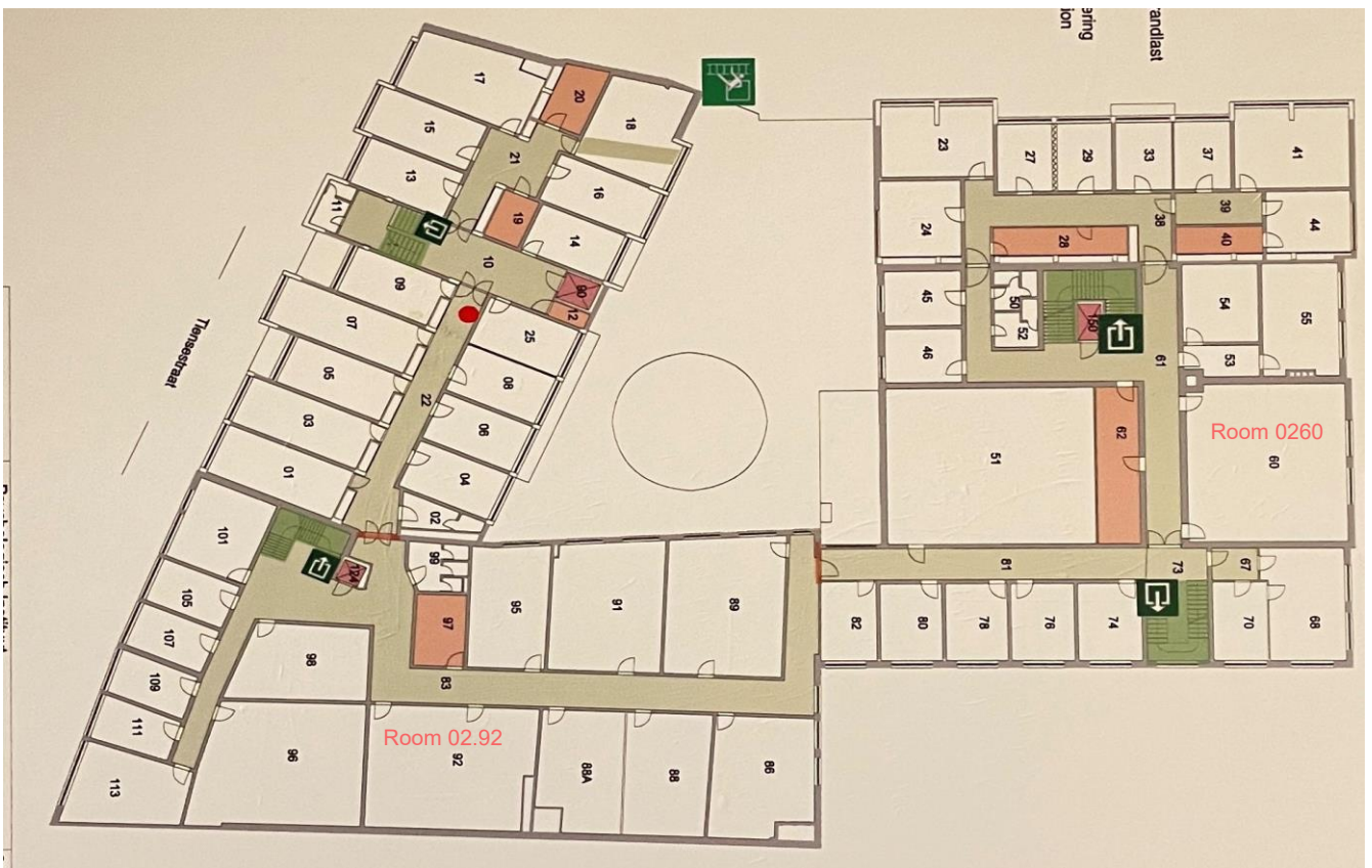
Second floor plan with indication of Room 02.92 and Room 02.60