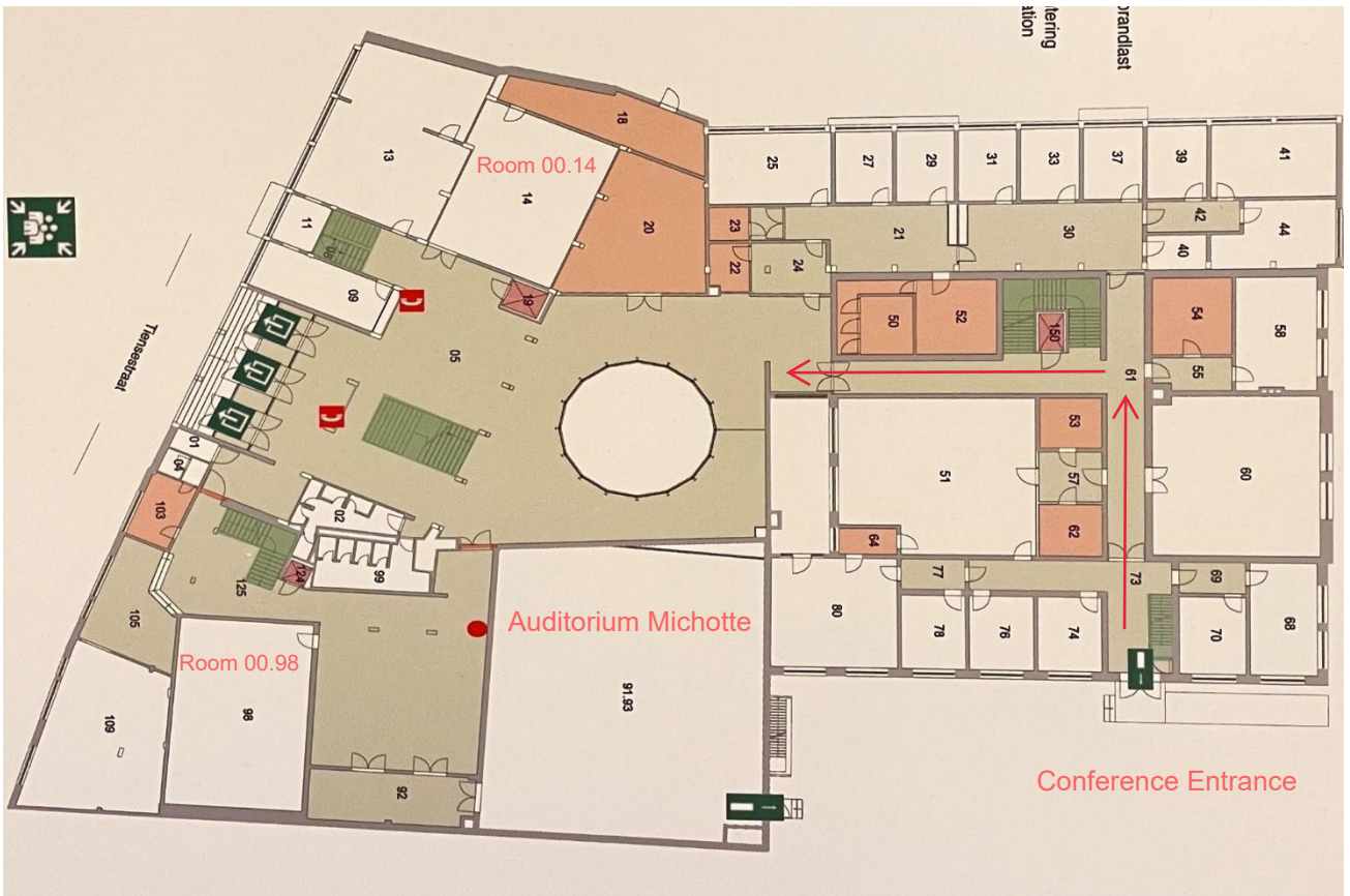
Ground Level Plan with indication of Auditorium Michotte, seminar room 00.98, seminar room 00.14